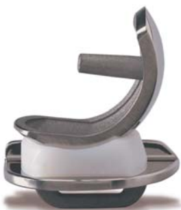
The Oxford® Partial Knee

The first partial knee replacement procedure was performed over 30 years ago. Since then, hundreds of thousands of people have received partial knee replacements. Partial knee replacement surgery is a fairly routine procedure with over 30,000 being performed every year in the United States alone.